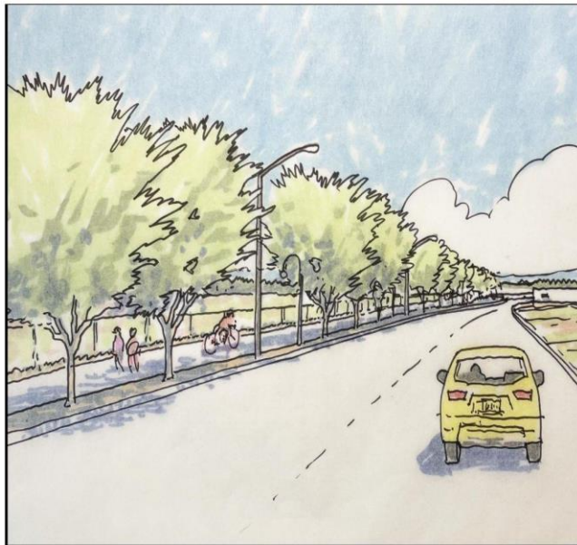
VIEW FROM FLORENCE AVENUE AND SOUTH WEST AVENUE ENTRY