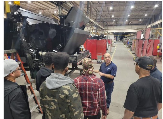
Students visit PB Loader in Fresno for a tour of their facility