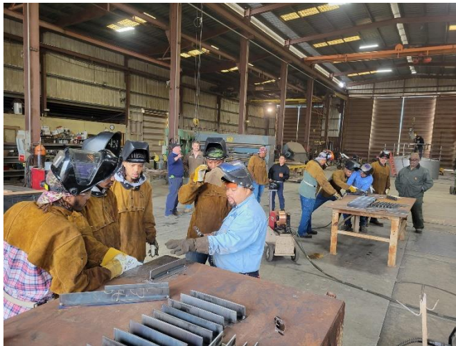
Students visit Steel Structures Inc. in Madera and take mock job interview welding test