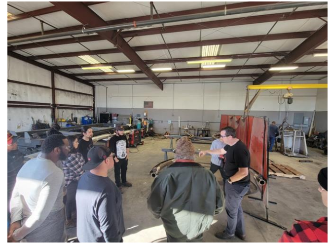
Students visit Excelsior Metals in Fresno for a tour of their facility