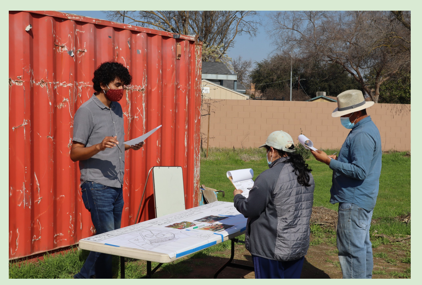
Image 1: Gardeners during an open house style focus group providing input on the development of Yo'Ville.