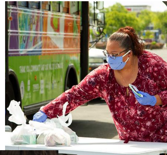
An employee provides census flyers with nutritious grab and go meals from the Food Express Bus.