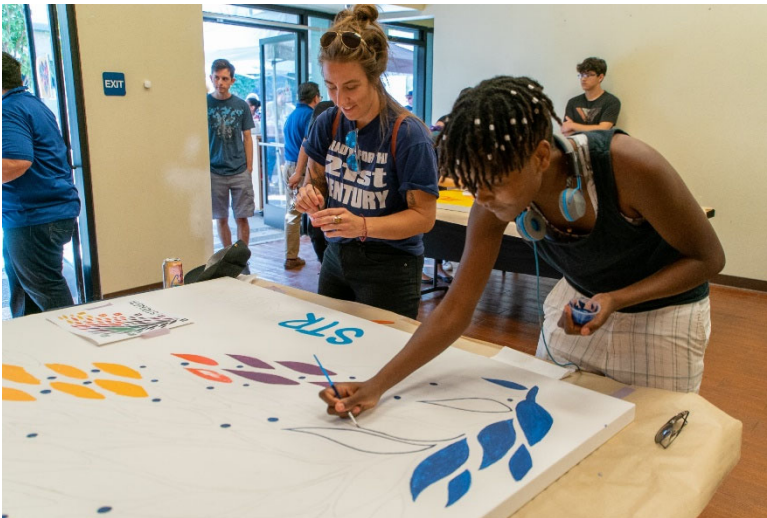
August 2019 Community Art Night at Art Hop