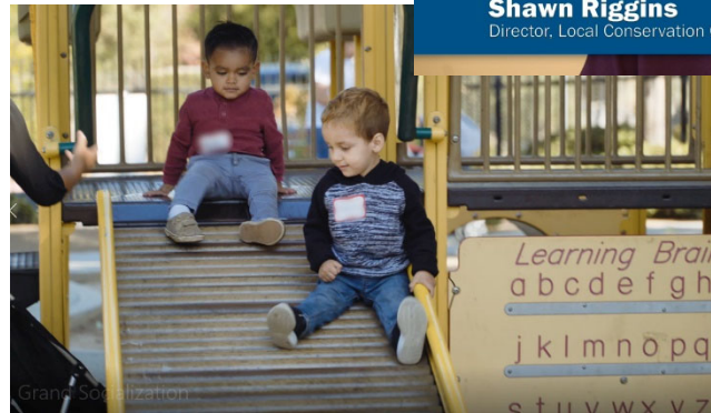
Scenes from some recent video projects.