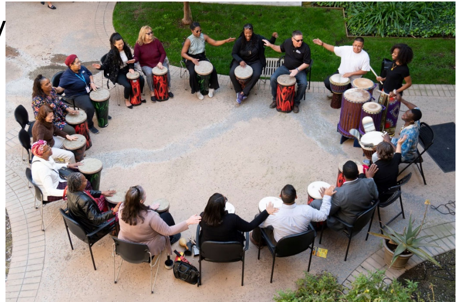
March 2, 2020 Celebrating Black History event featuring drumming circle by Libota Mbonda African Drumming Group