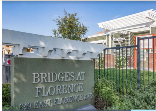
Bridges at Florence