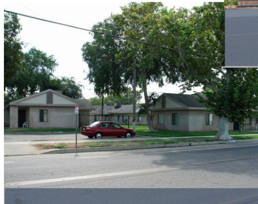
Sequoia Court Terrace