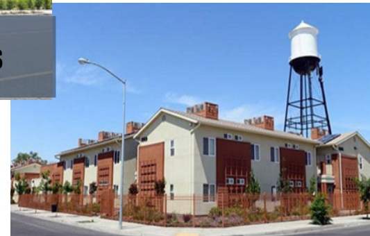
Renaissance at Santa Clara