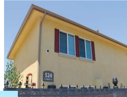
Renaissance at Trinity